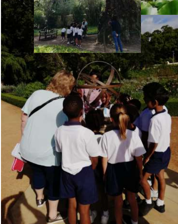
GRADE 2 EXCURSION TO VERGELEGEN